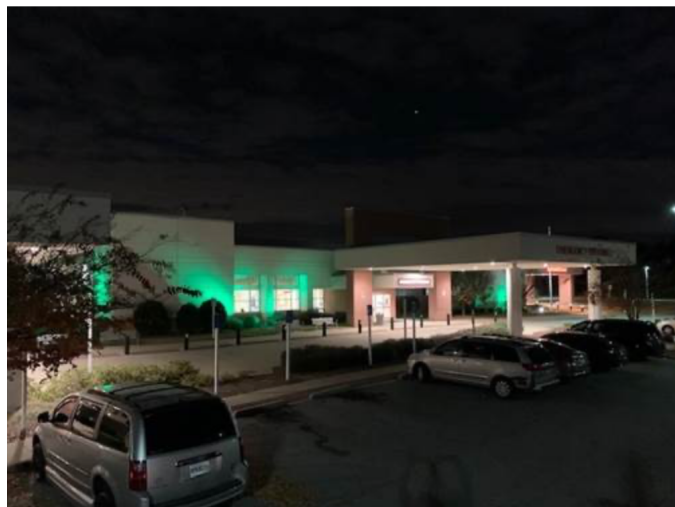
On Nov. 18, Piedmont Walton Hospital participated in the National Injury Prevention Day "Shine A Green"